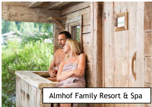
Almhof Family Resort & Spa