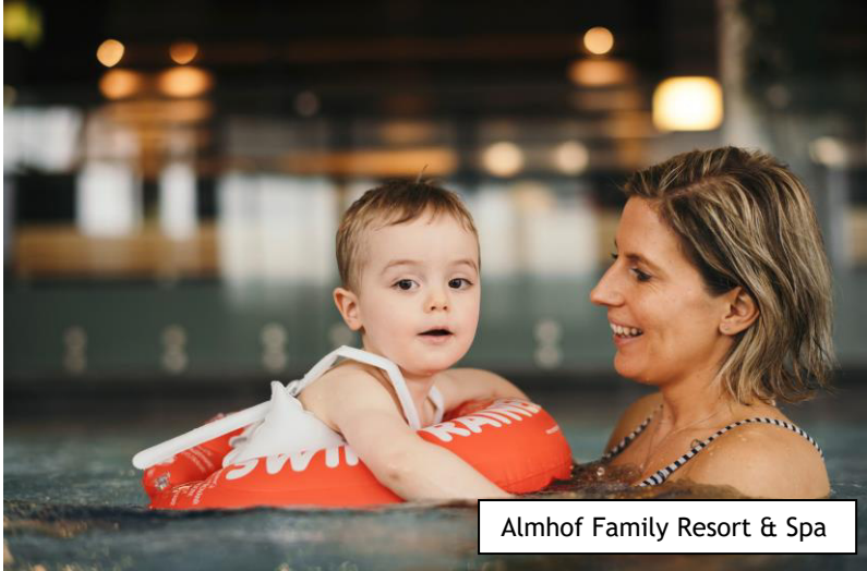
Almhof Family Resort & Spa