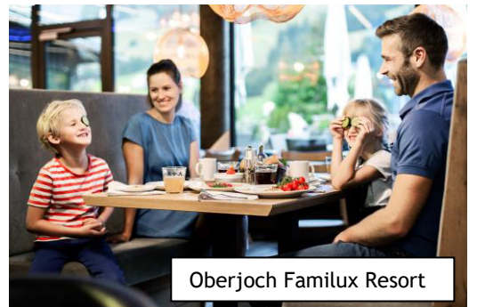
Oberjoch Familux Resort