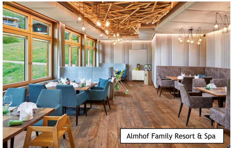
Almhof Family Resort & Spa