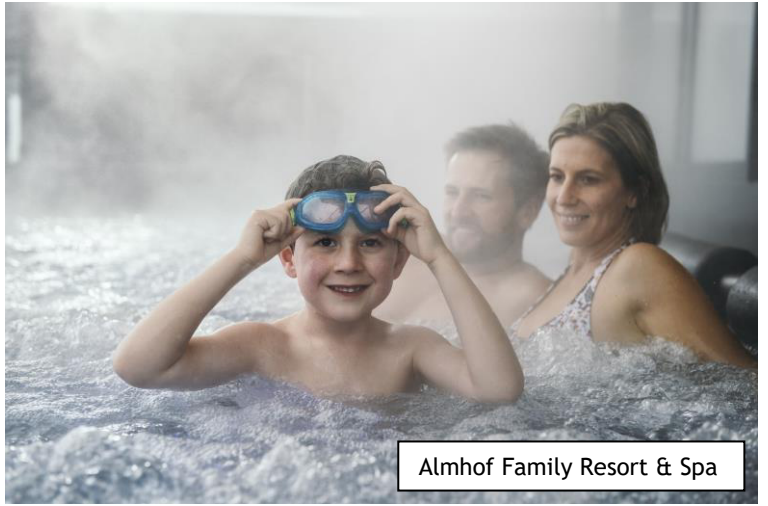
Almhof Family Resort & Spa